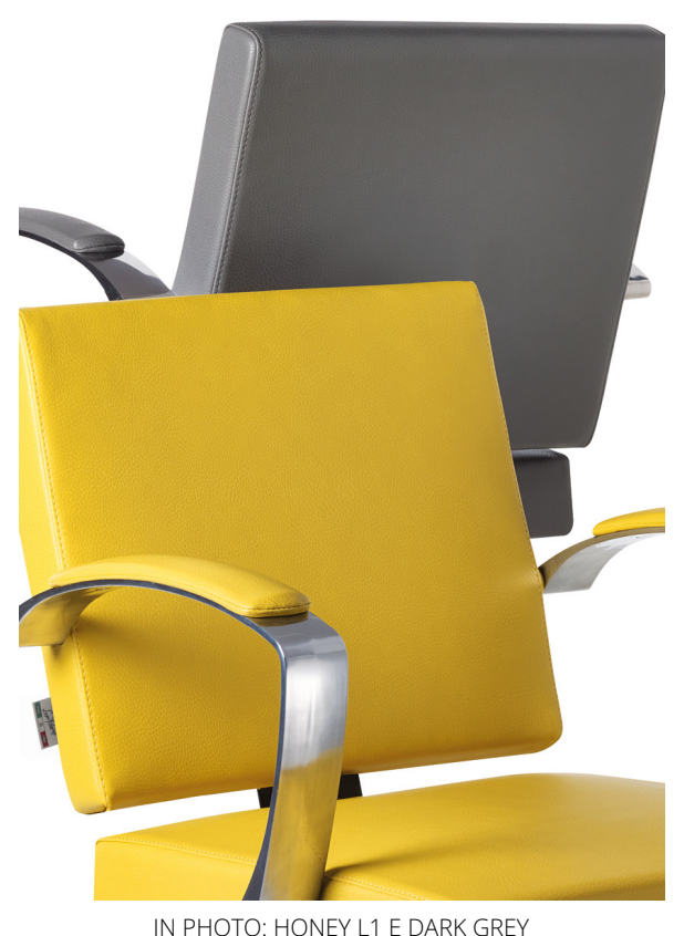
IN PHOTO: HONEY LT E DARK GREY Le immagini sono fornite al solo scopo illustrativo e non costituiscono elemento contrattuale