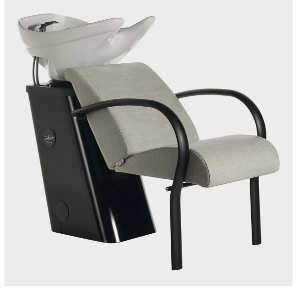
IN PHOTO: LR/W015/B - COLOUR A E B: VINTAGE ICE K8 Le immagini sono fornite al solo scopo illustrativo e non costituiscono elemento contrattuale